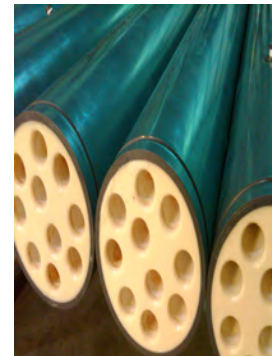
Duraflow 10-Tube Microfilters

The semiconductor fabrication process requires large volumes of ultra-pure water and generates a wide range of wastewaters of varying characteristics. The wide disparities in dissolved and suspended solids, metallic contaminants and proprietary chemical constituents have presented major technical challenges for fab shops to manage wastewater of this high complexity. Most of the water is consumed for processes including CMP, wet etch, wafer cleaning, dicing and backside grinding. As the global demand for semiconductor devices continues to grow at a rapid pace, the fabs have to confront the ever-increasing water scarcity issue and become self-sufficient of the water resource to meet the production needs. Duraflow (DF) developed state-of-the-art membrane microfiltration technology to address these difficult problems. The DF microfiltration products can be applied in a number of semiconductor facilities to remove fluoride, copper and silicon particles from etching and CMP processes, and recycle or reuse high-quality wastewater generated from the wafer fabrication activities.