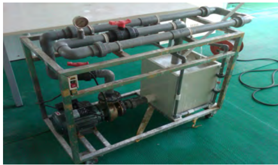
Figure 1 - Duraflow Pilot Test Unit

The Duraflow pilot test unit consists of a polypropylene tank, a centrifugal re-circulation pump, and two (2) 3-foot membrane tubes with 0.14 M 2 (1.5 ft 2 ) membrane area as the major components. Flow meter and pressure gauges are provided for measurement of key operating parameters. All the components are assembled on a portable stainless steel frame as shown in Figure 1 below. The chemically pre-treated river water sample is pumped at a high velocity through the membrane tubes. The turbulent flow, parallel to the membrane surface, produces a high-shear scrubbing action which minimizes deposition of solids on the membrane surface. During operation, clear filtrate (Figure 2) permeates through the membrane, while the suspended solids retained in the re-circulation loop are periodically purged to maintain a TSS concentration of 2% – 3% (wt).