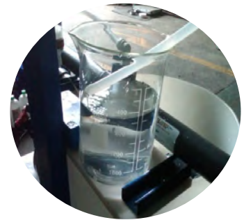
Figure 2 – Filtrate Sample

Throughout the test, the membrane flux stabilized at around 550 GFD (935 LMH) and the unit produced a filtrate quality meeting the RO feed specifications. The performance data suggested that the membrane based design, as illustrated in the following MF/RO treatment process diagram, could eliminate the carbon columns, extend RO membrane cleaning to once every 3 to 5 months and reduce membrane replacement frequency to >4 years.