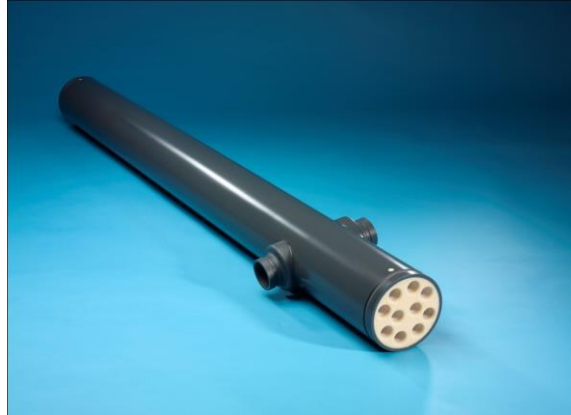
Figure 1: 10-Tube Tubular Microfilter Module